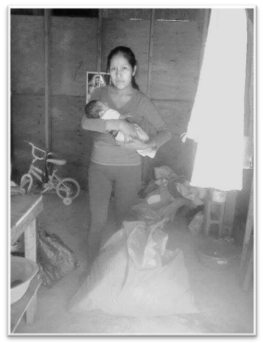
Mom in Baja Mexico with a Layette.

SOOOOO much for the layette. Before they wheeled me into surgery at the hospital, they asked for diapers, clothes and blankets. The only gift I had for my newborn baby was from your ministry. What a blessing you gave to us." We are so glad to be used of the Lord for this special need. Thank you for partnering with us.